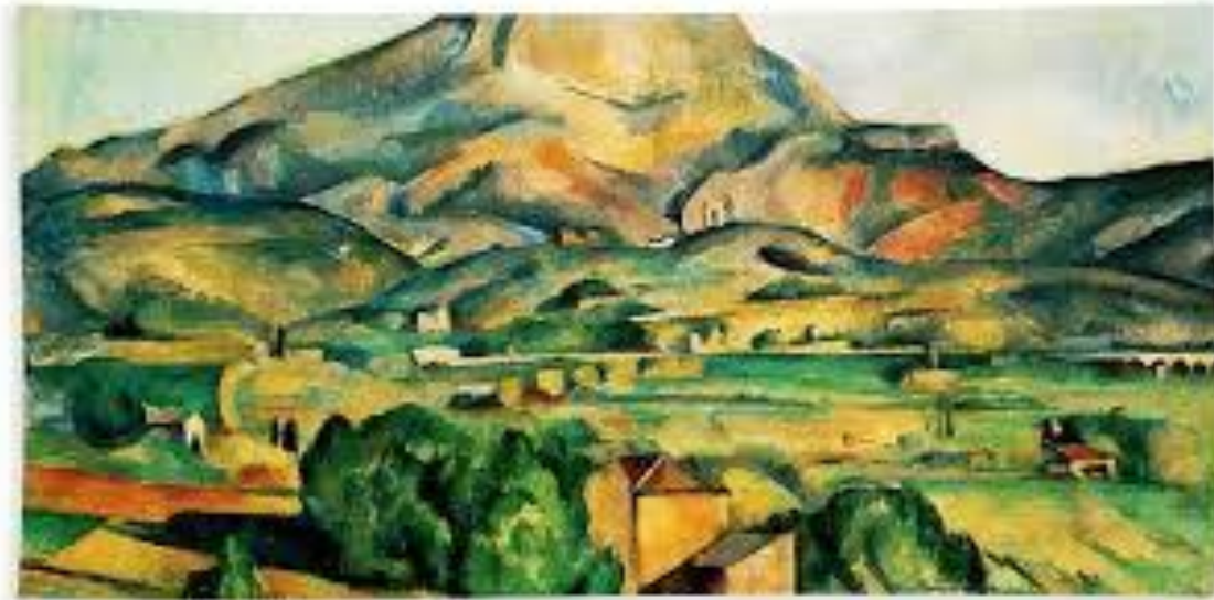
French artist Paul Cézanne - Mont Sainte-Victoire - 1905

OPTION: Use each layer of art to create a story.