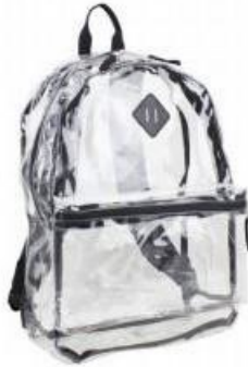
Example of permitted clear backpack.

Beginning with the 2022–23 school year, all bookbags (backpacks) must be clear. Students will carry their laptops in the school-issued, non-transparent laptop bag. RCPS will provide each student with one clear bookbag at the beginning of the school year. Students participating in an extracurricular activity are permitted to carry non-transparent bags to store items pertaining to their particular activity (i.e. band, athletics, etc.). Upon entry into the school, all extracurricular activity bags must be stored in lockers or designated areas. All bags are subject to search. Additionally, the maximum size for non-transparent bags that students will be permitted to carry during the school day, such as lunch kits, pencil bags and purses, will be 6" x 9".