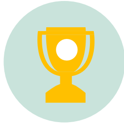
50+ Soft Skills Courses