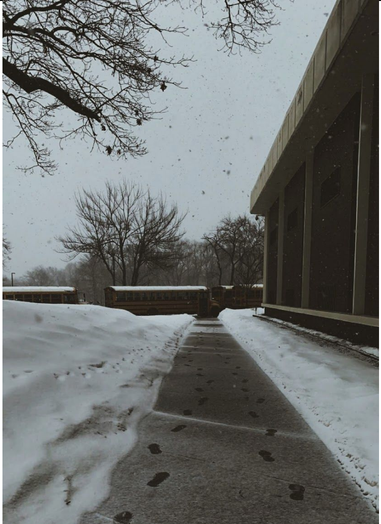
On the front cover: You never know when its going to snow in New Jersey.

THIS ISSUE IS LOADED WITH NEW STORIES, RANGING FROM REALITY TV TO TECHNOLOGY! PLEASE READ THE ENTIRE ISSUE TO FIND OUT!